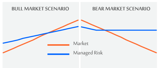
This graph is for illustrative purposes only and does not represent the actual performance of any particular client's account. There is no guarantee that Managed Risk will behave in the manner illustrated.